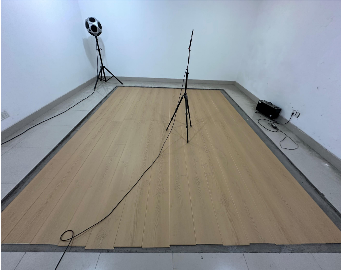
Test set up