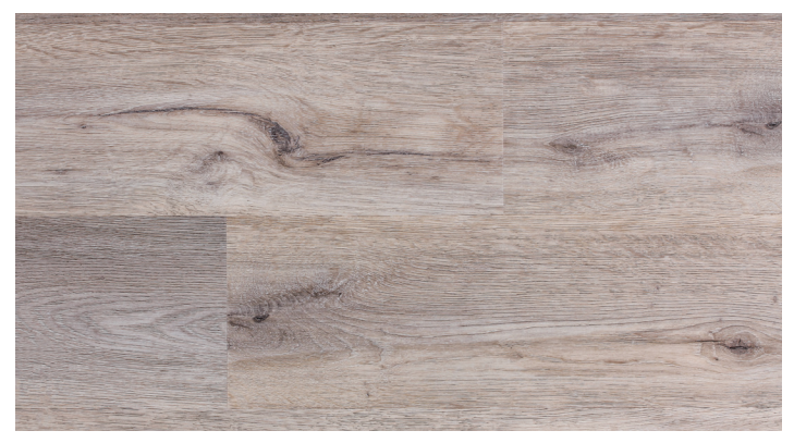
LI-W01 White Wash