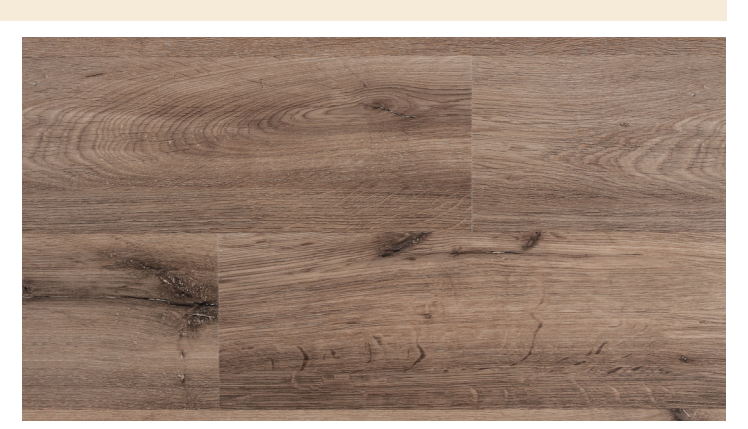
LI-W02 Autumn Accent