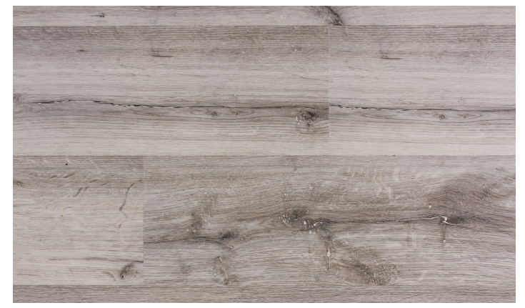
LI-W03 Grey Horizon