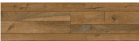
BB-XIII Oak Rhapsody