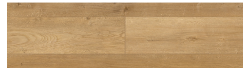
BB-XII Naples Parfum