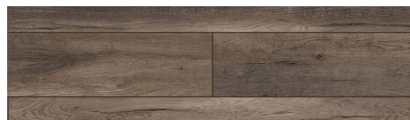
BB-XIV Cliffside Oak