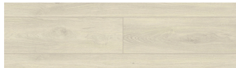
BB-XI Ocean Breeze