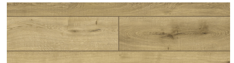
BB-IX Lumber Yard