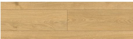
BB-X Timber Glaze