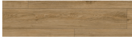
BB-II Toy Block