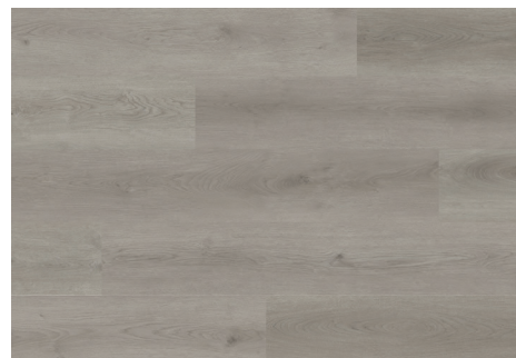
LI-DP03 West Chelsea