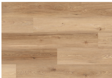
LI-DP05 Sun Valley