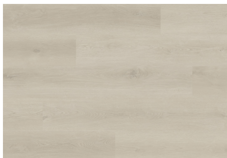
LI-DP04 Midtown East