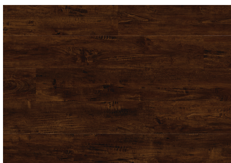
LI-DP08 Capitol Hill