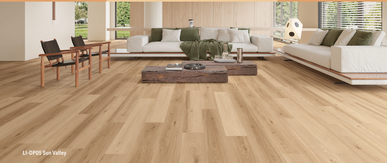
LI-DP05 Sun Valley

Lions Floor District Pro collection was created with exclusive patterns topped with intricate wood grain embossed surfaces to coordinate with various design options. Featuring a fiberglass-reinforced structure, the product delivers dimensional stability that yields high traffic tolerance. The District Pro collection is an embodiment of timeless aesthetics and performance-driven functionality.